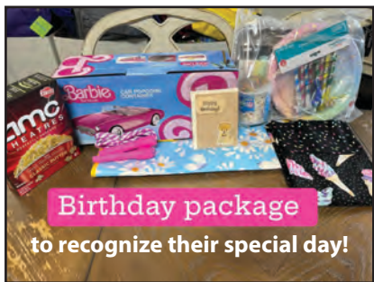
Birthday package to recognize their special day!

Although you may not always hear the individual stories of the students you help, I want to share a few that highlight the significance of your contributions. Many of our students face tremendous challenges, including losing their homes to wildfires, experiencing domestic violence, entering foster care, or arriving in our country with little more than the clothes on their backs. Additionally, many families struggle to provide basic necessities as their children grow.